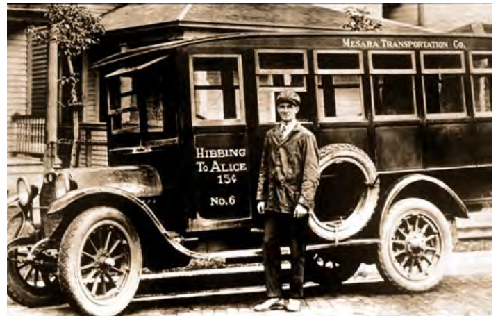
In 1914, Carl Eric Wickman began transporting miners from Hibbing to Alice, Minn. for 15 cents a ride.

The following day the newest Cunard liner, RMS Aquitania, left Liverpool, England on her maiden voyage for New York City. Considered one of the most beautiful ships of her time, Aquitania was also known as "Ship Beautiful" and she would survive troopship service during two world wars. Remaining in service until 1950, Aquitania was the last of the four funnel passenger liners to be decommissioned.