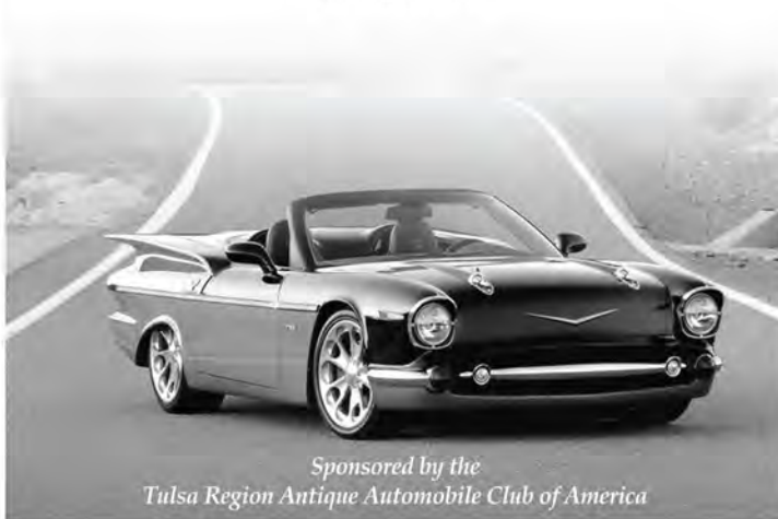
Sponsored by the Tulsa Region Antique Automobile Club of America